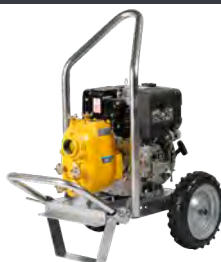
VAR 2-100 B TROLLEY - R