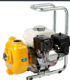
VAR 2-100 B LIFT - R